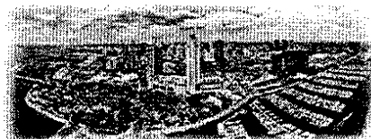
Bahia Hotel Mission Bay